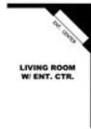
LIVING ROOM W/ ENT. CTR.