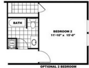
OPTIONAL 2 BEDROOM